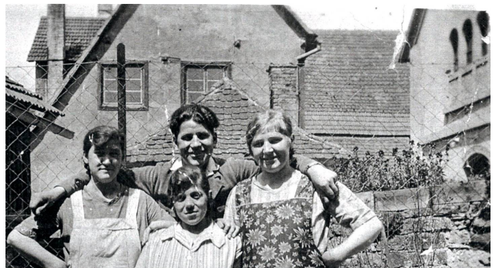
Picture taken in Brunnengasse ca.1925: Behind the figures is the roof of the Mikwe. Far right, the west facade of the Synagogue. In the background is the

The Mikwe , or ritual women's bath, stood directly next to the west facade of the Synagogue. The spring which provided the necessary water was particularly productive and during dry spells the 'Jews' Well' was one of the few still-functioning water sources in the village. In 1868, the Wiesloch district office criticised this bath because it is situated in a small, chilly, cellar-like room without proper drainage and without adequate means of heating the water 11 . This warm-water bath had been required on the original planning permission 12 . It was high time to have it appropriately equipped with a warm tub above the ground.